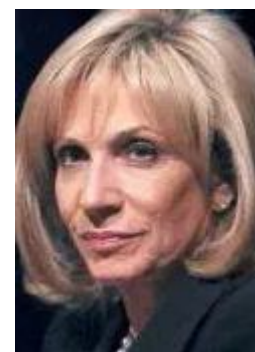
( https://freddonaldson.files.wordpress.com/2018/05/mitchell1.jpg )

Andrea Mitchell ( https://en.wikipedia.org/wiki/Andrea_Mitchell ), Spouse of Alan Greenspan (former Chairman of the Federal Reserve), Chief Foreign Affairs Correspondent, NBC News, Washington