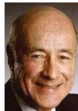
Joseph S. Nye, Jr.

*Joseph S. Nye, Jr. ( https://en.wikipedia.org/wiki/Joseph_Nye ), University Distinguished Service Professor and former Dean, John F. Kennedy School of Government, Harvard University, Cambridge; former Chair, National Intelligence Council; former U.S. Assistant Secretary of Defense for International Security Affairs; former North American Chairman, Trilateral Commission